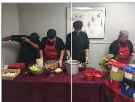
The wonderful meal prepared by students.