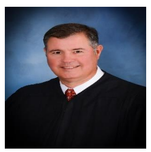
Honorable H. Charles Carl III Judge of the 22<sup>nd</sup> Judicial Circuit December 31, 2022